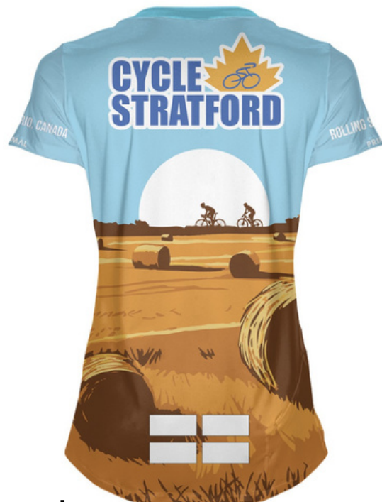
Women's Henley $71 USD

*Mock up only; design and colours subject to change. Rectangles represent sponsor logos.