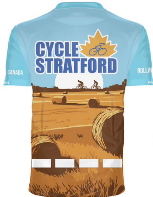
Men's Henley $71 USD